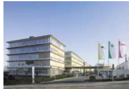
Main production facility at Herzogenaurach, Germany

The Schaeffler Group, headquartered in Herzogenaurach, Germany is one of the world's largest automotive industry suppliers. With 66,000 employees in 180 locations worldwide, the Schaeffler Group finished 2007 with 8.9 billion Euros in sales. All over the world, the Schaeffler Group's INA, FAG and LUK brands stand for the development and manufacture of rolling bearings, plain bearings and linear guides for machine building and engine components.