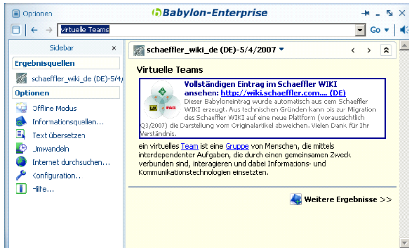
In-house Schaeffler-Wiki

Another interesting implementation was done with the Schaeffler-Wiki, making a bridge between this invaluable knowledge to the workers' desktops with a simple click of a mouse. The worker now gains fast access to new and changed entries and with a simple double-click on the definition window, the worker is redirected automatically to the full article in Schaeffler-Wiki.